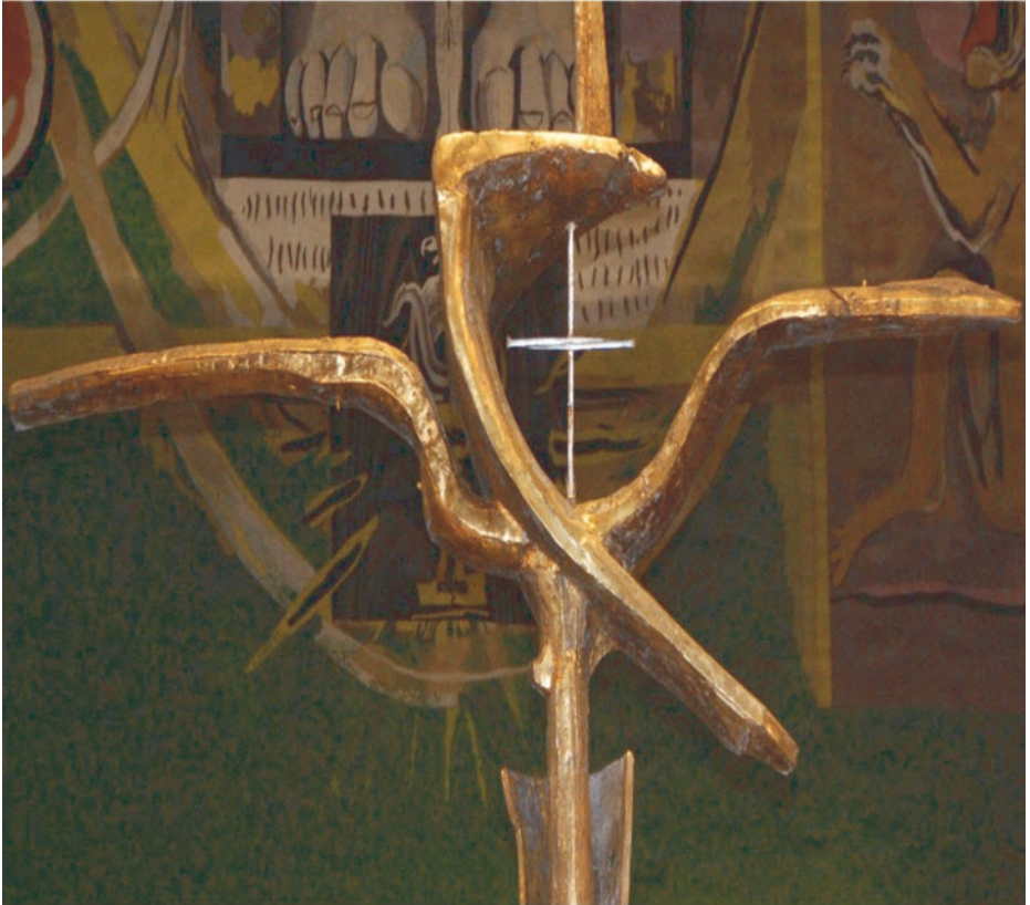
Coventry's Cross of Nails

“We try to banish all thoughts of revenge.”