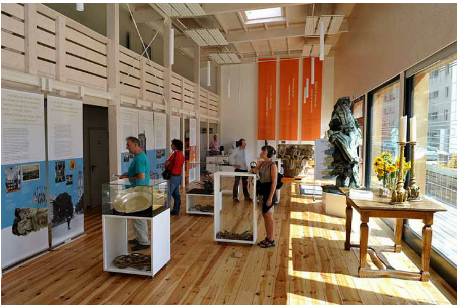
The exhibition about the history of the Garrison-Church

The Chapel is a place for church services and for praying for world-wide peace and reconciliation. But it is also a place for