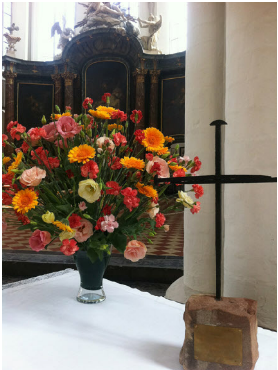
The Cross of Nails in St. Mary's Church

On the 60 th anniversary of the end of the Second World War the Cross of Nails was presented to the parish in an ecumenical service. Since then we hold a service for peace every Friday at 12:30 p.m. with an organ recital on our Wagner organ. In this service we use the Coventry Litany and explain the meaning of the Cross of Nails. These services are conducted not only by members of our staff but also by members of our congregation. Every day many tourists from home and abroad visit our church as the last surviving medieval monument and a city church. On Fridays they will be invited to join with regular members of our congregation attending our midday services, to spend a time of quiet, of contemplation and prayer.